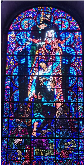
“Salvation Window” - Ervin Bossanyi (Canterbury Cathedral)

“Let us see thy great salvation Perfectly restored in thee” from Love Divine - Charles Wesley